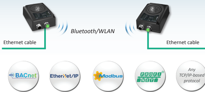
Replacing an industrial Ethernet cable.